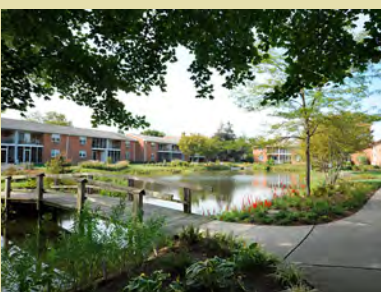
Harbour Club Apartments, Babylon, NY