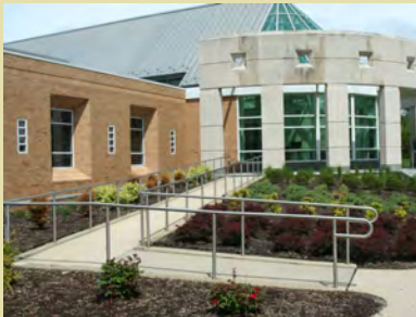
Farmingdale Library, Farmingdale, NY