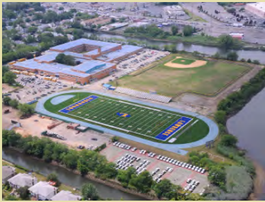
Lawrence HS Track & Fields, Lawrence, NY