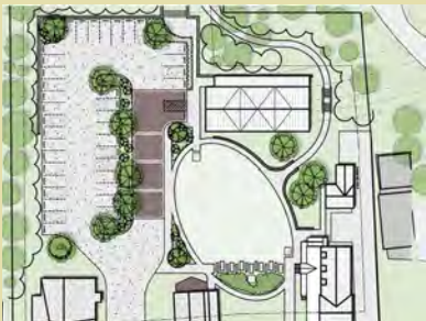
Gallery North Art Gallery, Setauket, NY