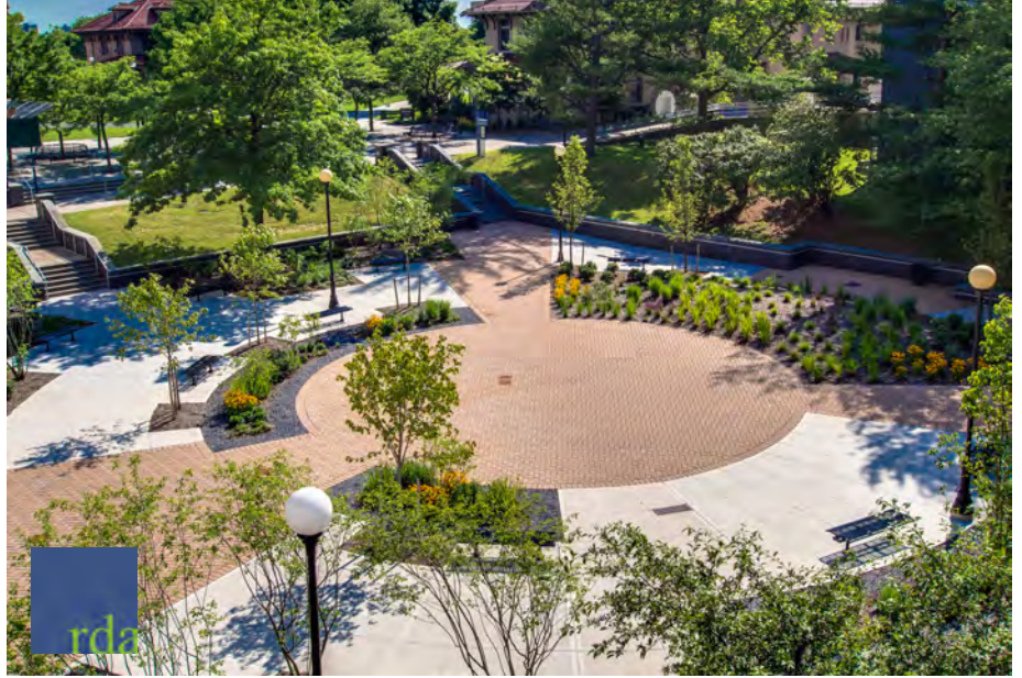
Kiely Hall Plaza Rain Gardens, Queens College

CONTEXT + EXPRESSION = FORM: As designers and planners, we research and absorb the social, historical and cultural contexts of a site in order to develop physical and symbolic links that will determine the forms and spaces on a site. We strive to tie a project into the fabric of the community and make it seem familiar while at the same time, unique.