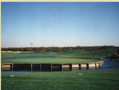
Heartland Golf Course, Deer Park, NY