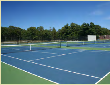
Suffolk Cty. Comm. College, Selden, NY