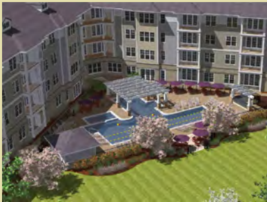
Solace Apartments, Virginia Beach, VA