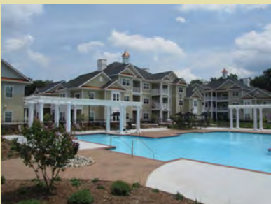
Fenwick Apartments, Chesapeake, VA