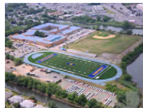
Lawrence HS Track & Fields