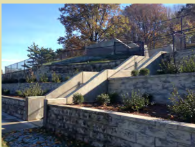
Great Neck South HS, Great Neck, NY