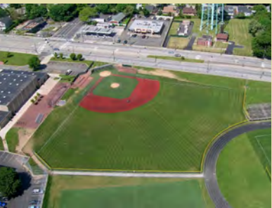
Holy Trinity HS Baseball Field, Hicksville, NY