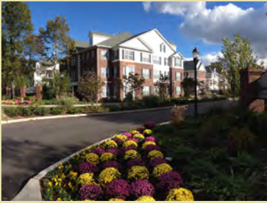
AvalonBay Apartments, Garden City, NY