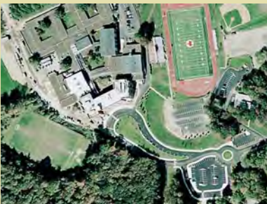
Fox Lane HS Campus, Mt. Kisco, NY