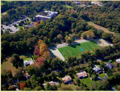
Our Lady of Mercy Academy, Sysosset, NY