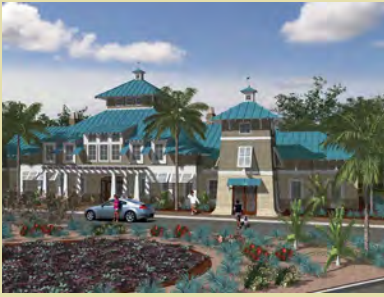
Sea Wynde Plantation, Charlotte, NC