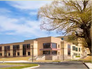
Mamaroneck Elem. School, Mamaroneck, NY