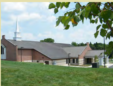
US Liberty Chapel, Fort Lee, VA