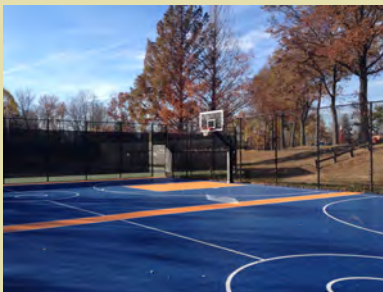
Great Neck South MS, Great Neck, NY