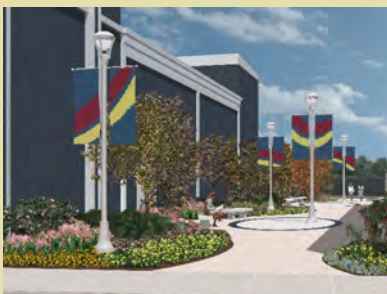
Boulton Theater Plaza, Bay Shore, NY