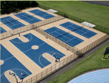
Malverne HS Tennis Courts, Malverne, NY