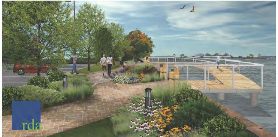
Manhasset Bay Walk Trail, Port Washington, NY

HEALTH, SAFETY & WELFARE: Our public space and sports design philosophy revolves around user safety. Access elements such as ramps, stairs, walkways, crosswalks, parking and safe direct circulation figure prominently in our site design. Whether it be for participants or spectators, our designs always meet or exceed ADA, state and local code requirements.