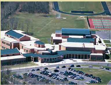
William Floyd MS, Center Moriches, NY