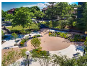
Queens College Campus Plazas

Based in St. James, NY on scenic Long Island, we provide Landscape Architecture services throughout the metropolitan New York region.