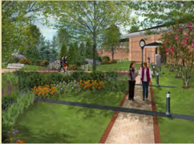
Suffolk Cty. Comm. College, Riverhead, NY