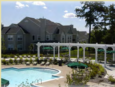
Avalon Pines, Coram, NY