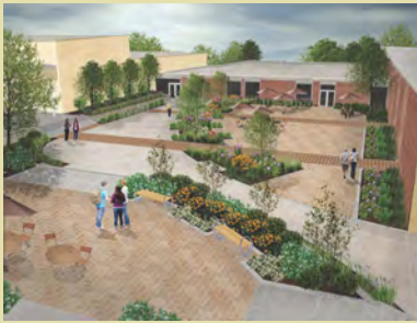
Queens College Dining Plaza, Queens, NY